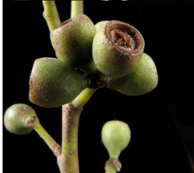
Eucalyptus obliqua Messmate