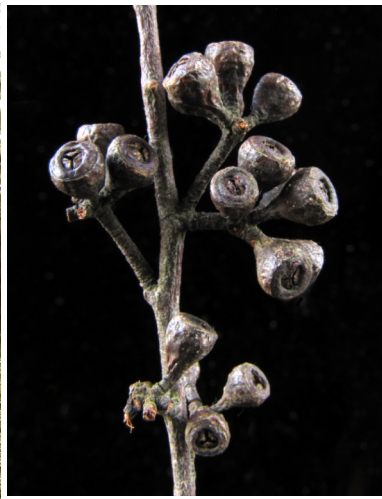
Eucalyptus regnans Mountain Ash