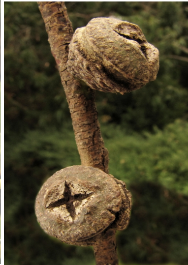
Eucalyptus globulus Blue Gum