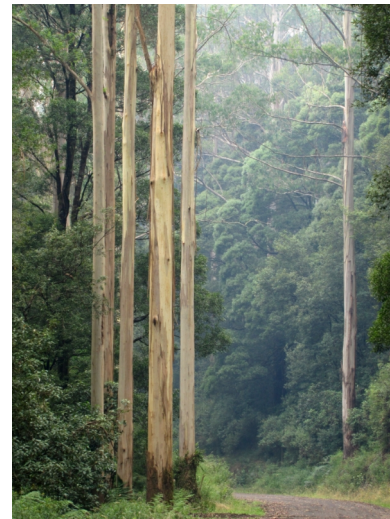
E. viminalis (Manna Gum)