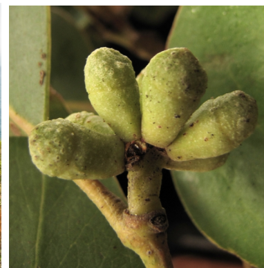
Eucalyptus baxteri Brown Stringybark