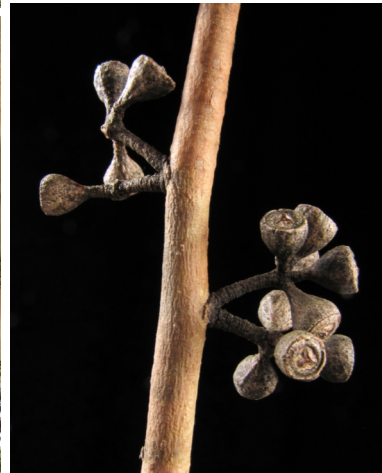
Eucalyptus viminalis Manna Gum