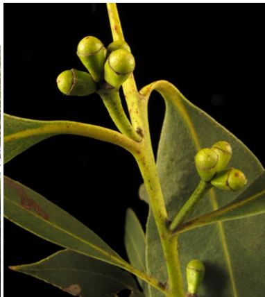
Eucalyptus kitsoniana Bog Gum