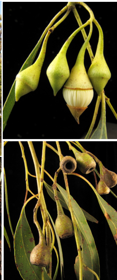
Eucalyptus tricarpa Ironbark