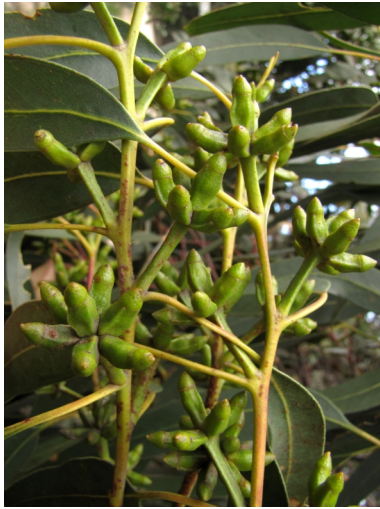
Eucalyptus litoralis Otway Grey Gum