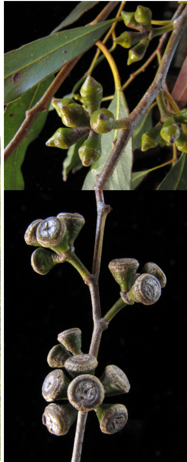
Eucalyptus brookeriana Brookers Gum