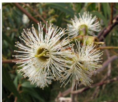
Eucalyptus cypellocarpa Mountain Grey Gum