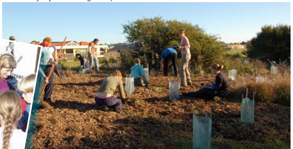
Local and International Student Volunteers help plant out the healthland.

We are not finished yet. Every year we review priorities and plan further projects to add to the value of the Foreshore Reserve as a conservation and a recreational asset for our community. Committee members were thrilled to receive the award and the community is just bursting with pride!